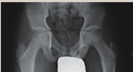
Ideal time for Surgical Intervention