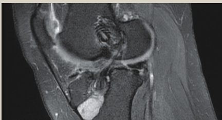
Grafts/Fixation option in Revision ACLR

Register yourself online at www.smawdelhi.com