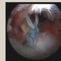
Rotator Cuff Repair