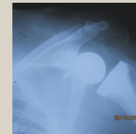
Reverse Shoulder Arthroplasty

Register yourself online at www.smawdelhi.com