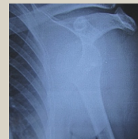
Recurrent Shoulder Dislocation